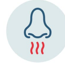
LOSS OF SMELL