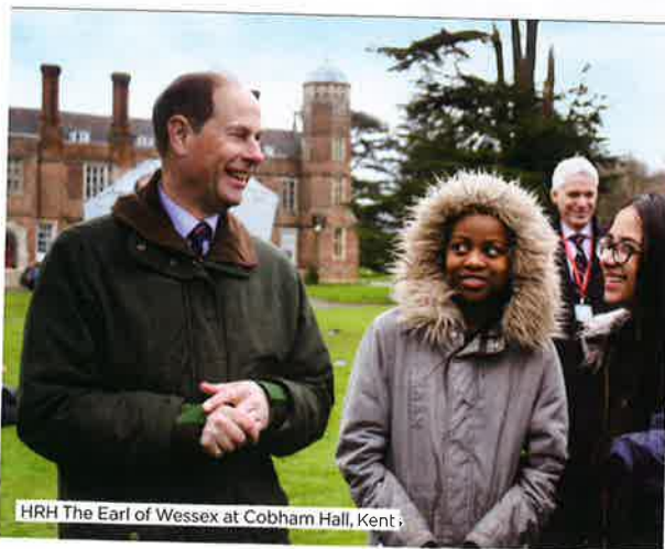
HRH The Earl of Wessex at Cobham Hall, Kent