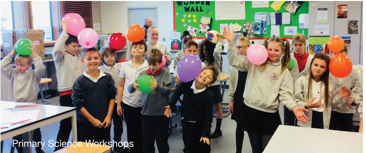
Primary Science Workshops