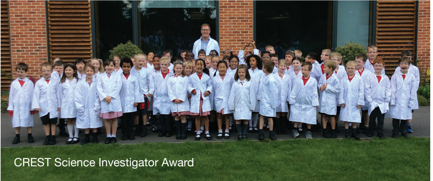
CREST Science Investigator Award