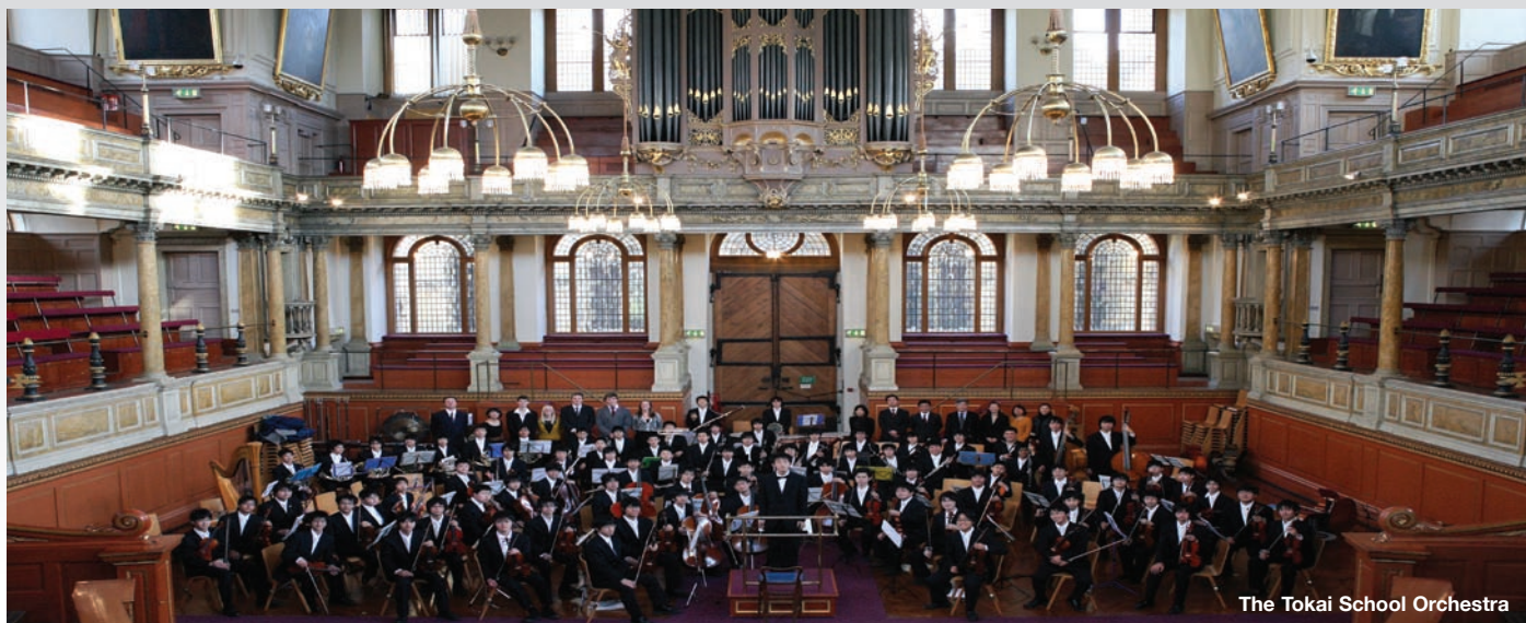
The Tokai School Orchestra

The Sheldonian Theatre, Oxford, provided the magnificent setting for a historic Anglo-Japanese concert on 23 March, performed by the orchestras of Abingdon and Tokai School, Nagoya, Japan. The concert was part of the Japan-UK150 celebrations marking the 150th anniversary of the signing of the Treaty of Yedo, which opened up diplomatic and trade relations between the two countries.