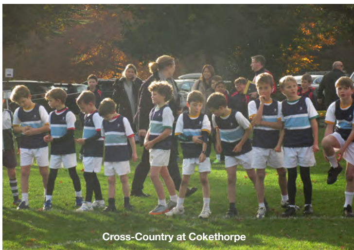
Cross-Country at Cokethorpe