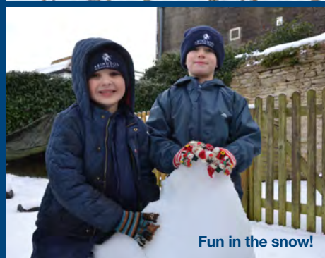
Fun in the snow!