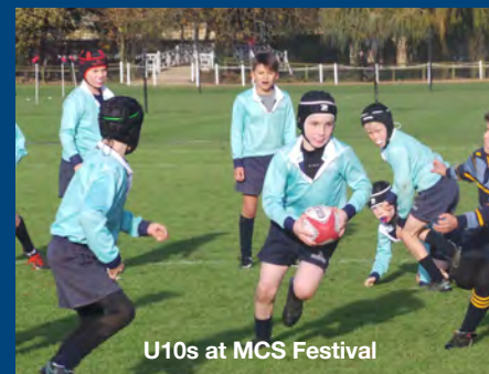
U10s at MCS Festival