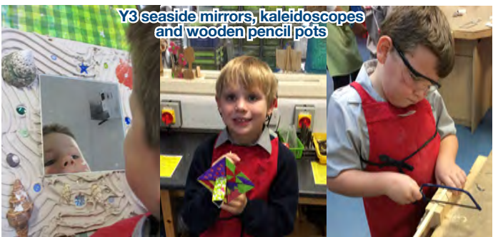
Y3 seaside mirrors, kaleidoscopes and wooden pencil pots