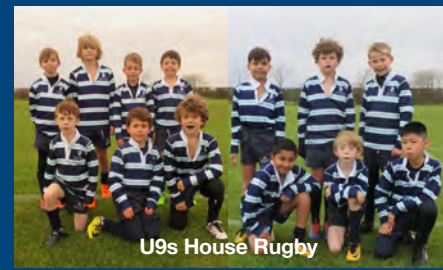
U9s House Rugby