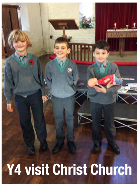
Y4 visit Christ Church