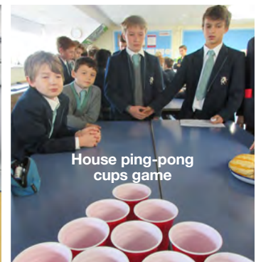
House ping-pong cups game