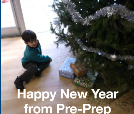
Happy New Year from Pre-Prep