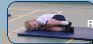
PE with Reception