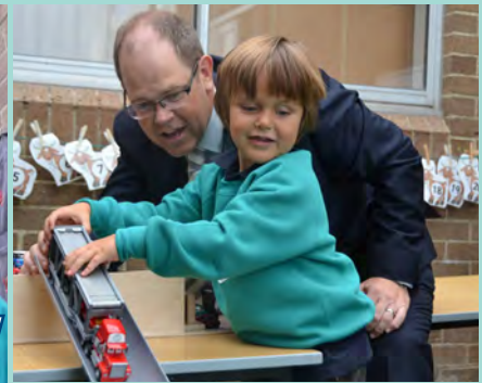
Reception's First Day