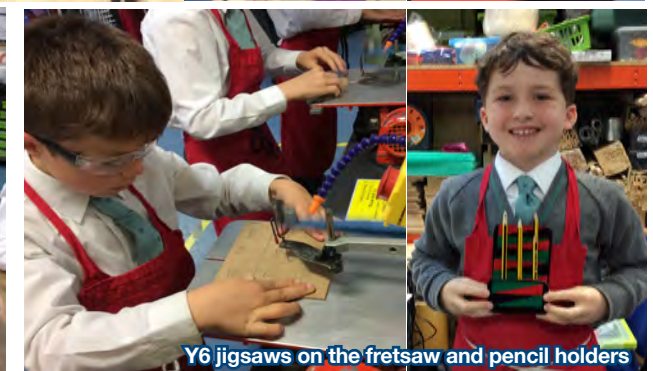
Y6 jigsaws on the fretsaw and pencil holders