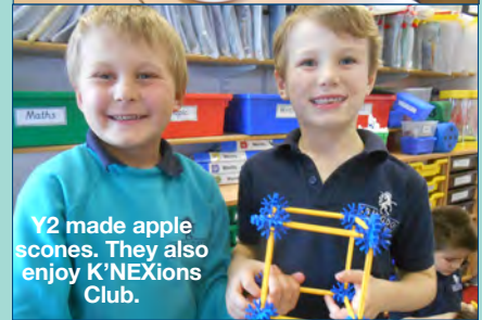
Y2 made apple scones. They also enjoy K'NEXions Club.