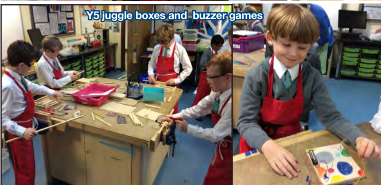
Y5 juggle boxes and buzzer games