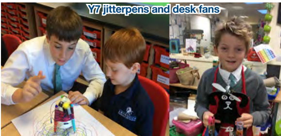
Y7 jitterpens and desk fans