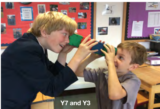
Y7 and Y3