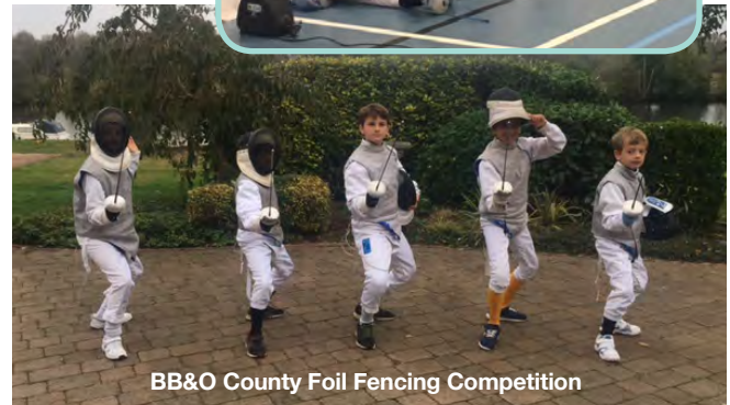
BB&O County Foil Fencing Competition