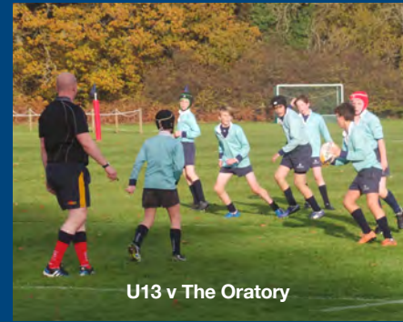
U13 v The Oratory

The U8s had a very enjoyable and successful tag rugby season with the As unbeaten in their three matches. All Year 3s thoroughly enjoyed their first experience of competitive rugby.