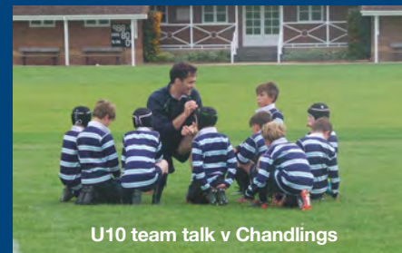
U10 team talk v Chandlings