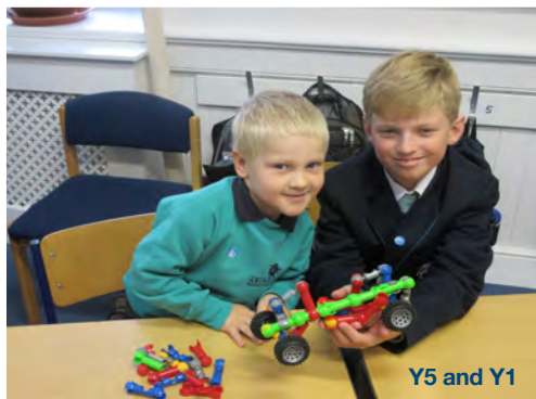
Y5 and Y1