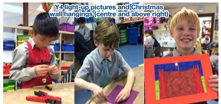
Y4 light-up pictures and Christmas wall hangings (centre and above right)