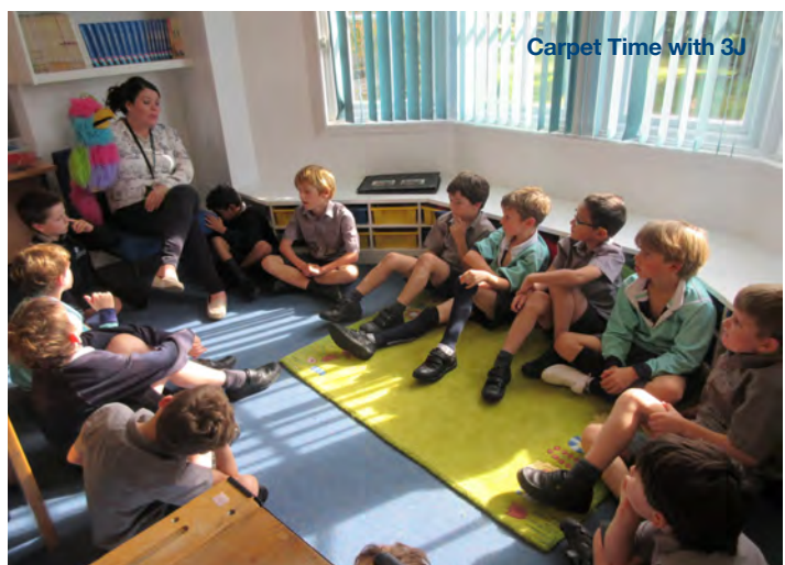
Carpet Time with 3J