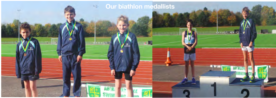
Our biathlon medalists