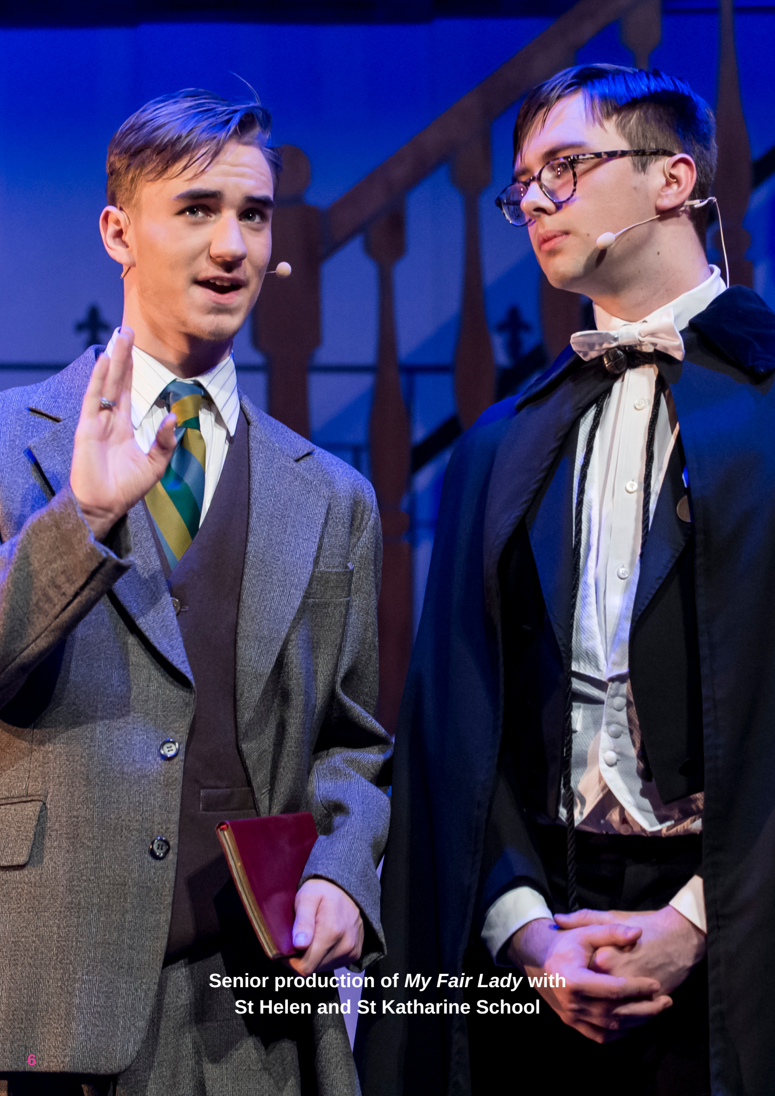
Senior production of My Fair Lady with St Helen and St Katharine School