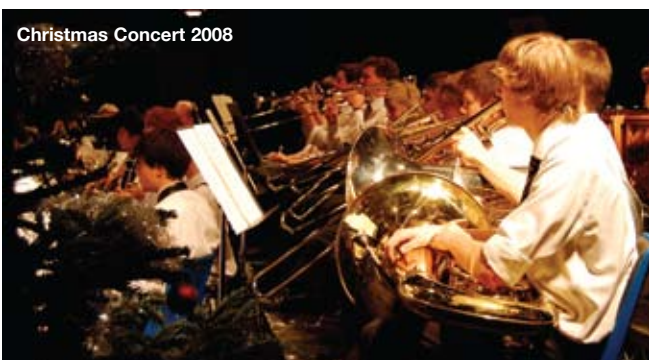
Christmas Concert 2008