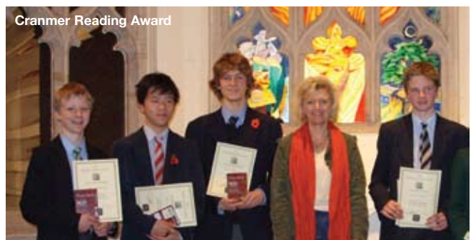
Cranmer Reading Award