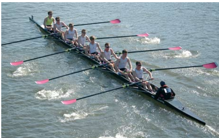
The 1st VIII at the Schools' Head