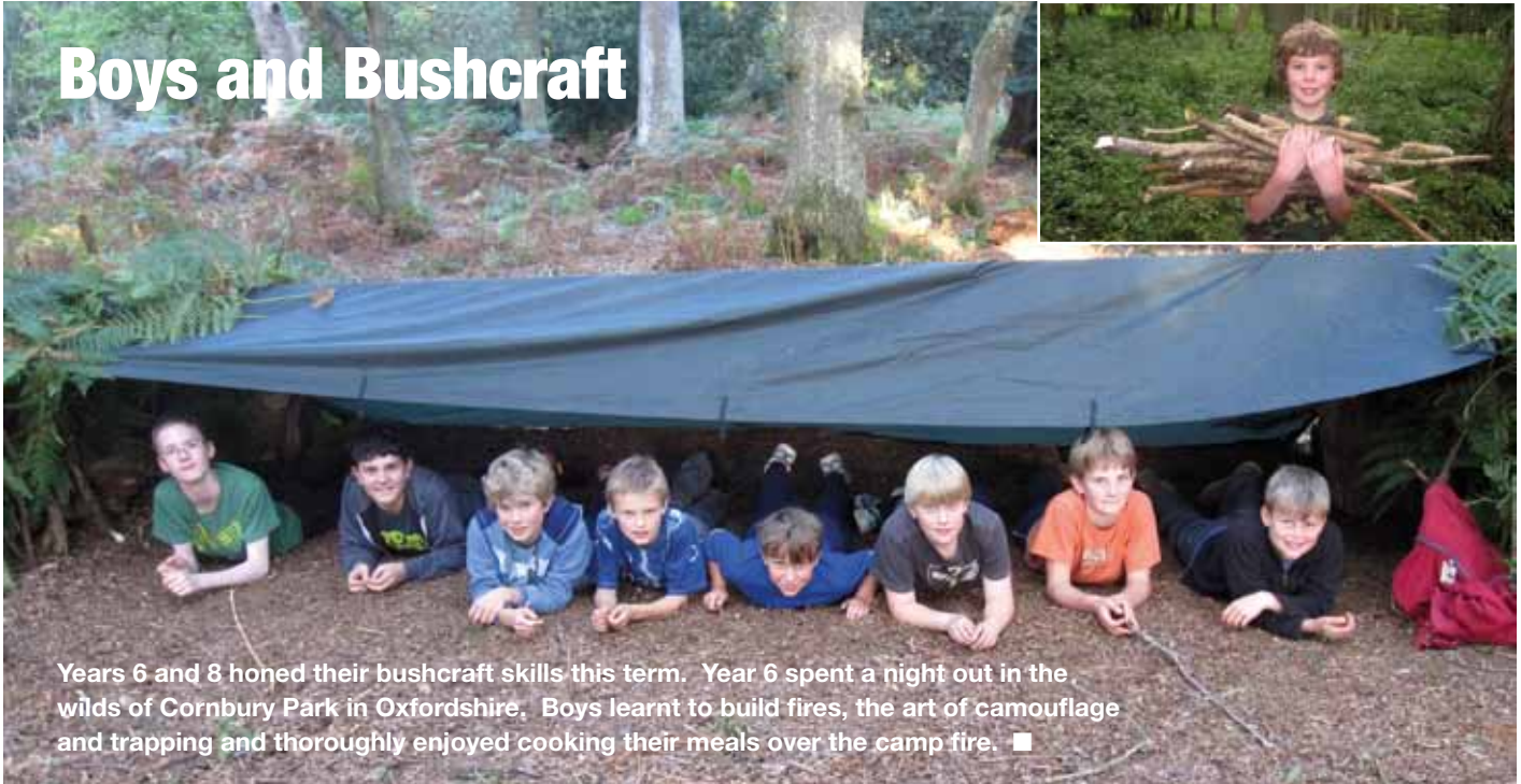
Years 6 and 8 honed their bushcraft skills this term. Year 6 spent a night out in the wilds of Cornbury Park in Oxfordshire. Boys learnt to build fires, the art of camouflage and trapping and thoroughly enjoyed cooking their meals over the camp fire. ■