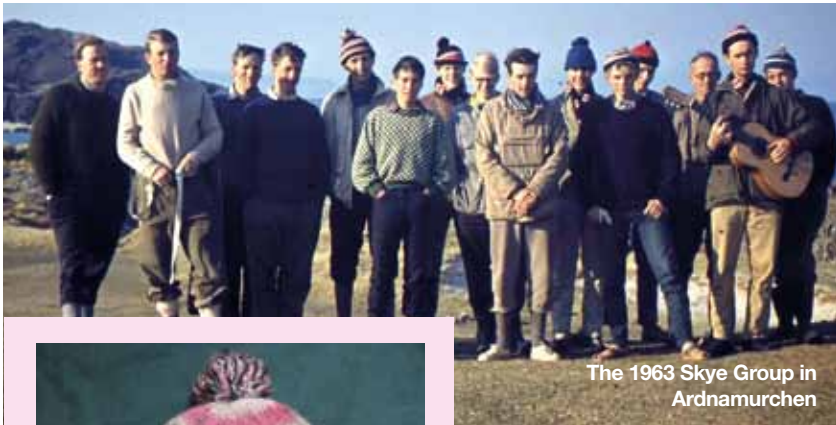
The 1963 Skye Group in Ardnamurchan

This was the start of the Skye Group. In 1958 the group went to Wasdale in the Lake District and the next year to the Isle of Arran. In 1960 and 1961 they returned to Skye – the bulk of the group hitch hiking from Abingdon to Fort William before catching the train to Mallaig and the ferry to Armadale.