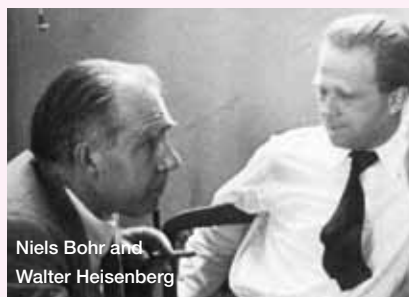
Niels Bohr and Walter Heisenberg

Abingdon's Studio Theatre Club will perform Michael Frayn's Copenhagen in the Amey Theatre on 13 March as part of the Oxford Science Festival. The play focuses on the meeting between Niels Bohr and Werner Heisenberg in Copenhagen in September 1941. Once colleagues in the field of nuclear research the war had made them enemies – what did they talk about? The play has a particular resonance for the town of Abingdon and for the School as many of the scientists working in the same field as Bohr and Heisenberg later worked at AERE Harwell and sent their sons to Abingdon School.