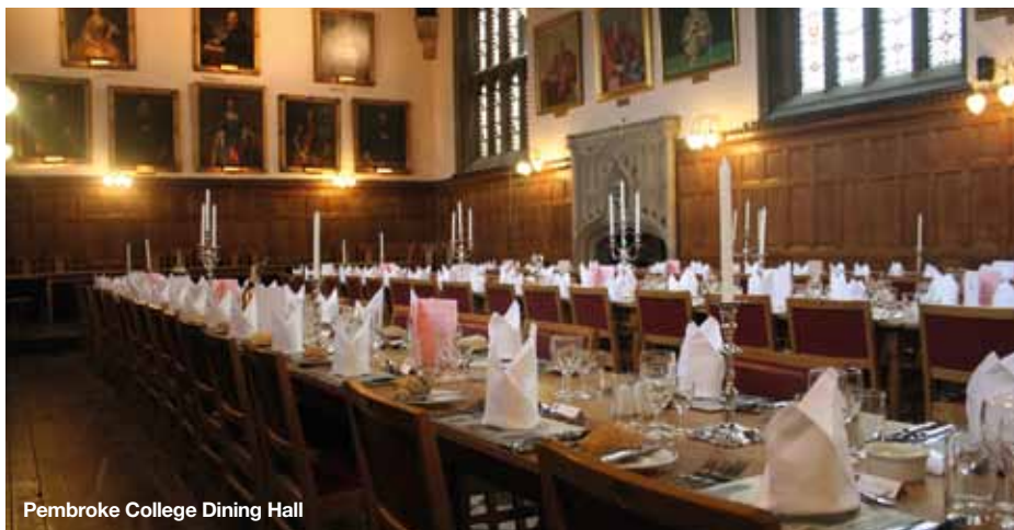
Pembroke College Dining Hall