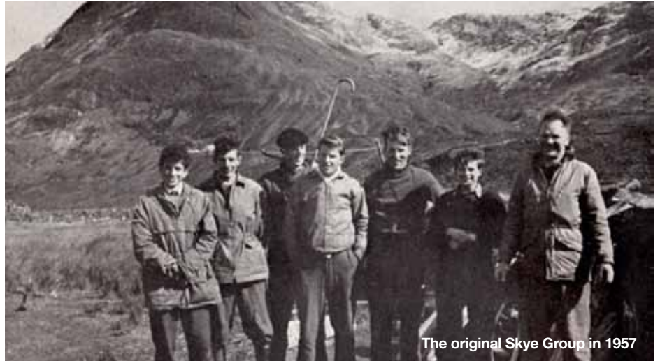
The original Skye Group in 1957

In April 1957 a party of sixth-form scientists set off for Skye on an expedition initiated and organised by the boys themselves. Its focus was the study of botany, geology, ornithology and geography in conditions that would “promote mental and physical alertness”. It was clearly an unforgettable experience. Skye is a beautiful, wild and remote place – but as the boys were happy to admit, much of the value of the expedition lay in the difficulties that had to be overcome, difficulties caused by the wild weather and the wild seas and the lack of facilities.