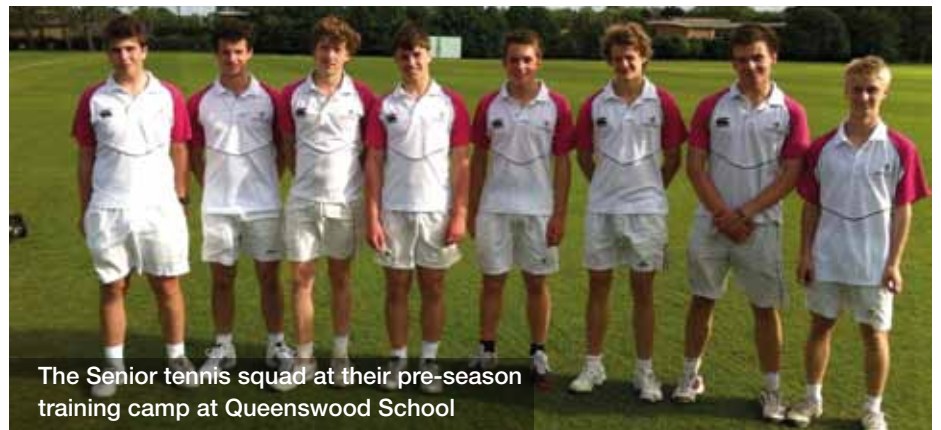
The Senior tennis squad at their pre-season training camp at Queenswood School

It was a good tennis season for the School, which won three titles at the Oxfordshire Independent Schools' Tennis Championships last term, the U18, U15 and the U14. The U18s finished 6th out of 16 in the Independent Schools' League and made it to the final of the St George's Tournament for the third successive year. The U14s have had a particularly good season, winning all their matches and beating Radley, MCS, St Edward's, Eton, Wellington, Stowe, Bradfield and Marlborough in the process. And both U13 pairs reached the last 16 in the National Tournament. ■