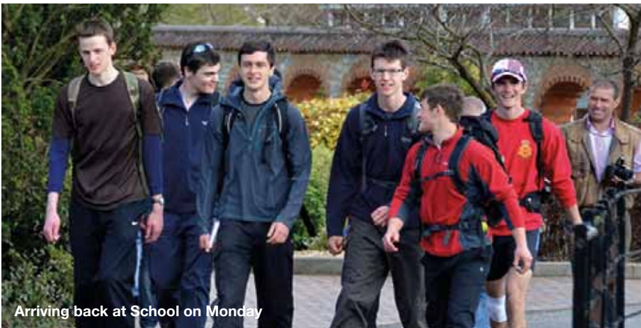
Arriving back at School on Monday