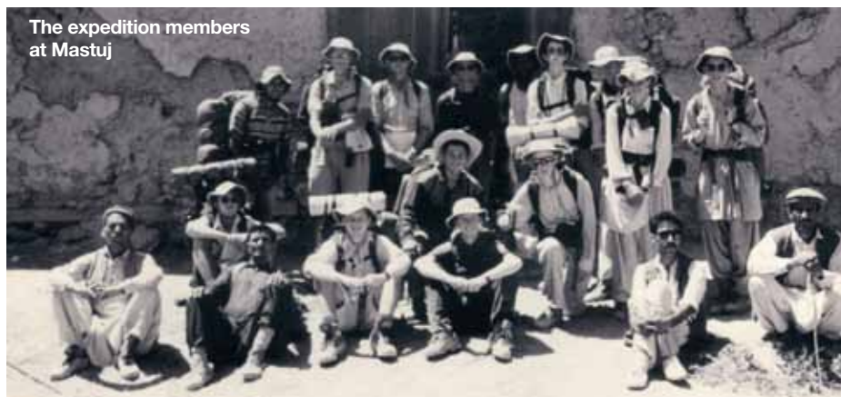
The expedition members at Mastuj