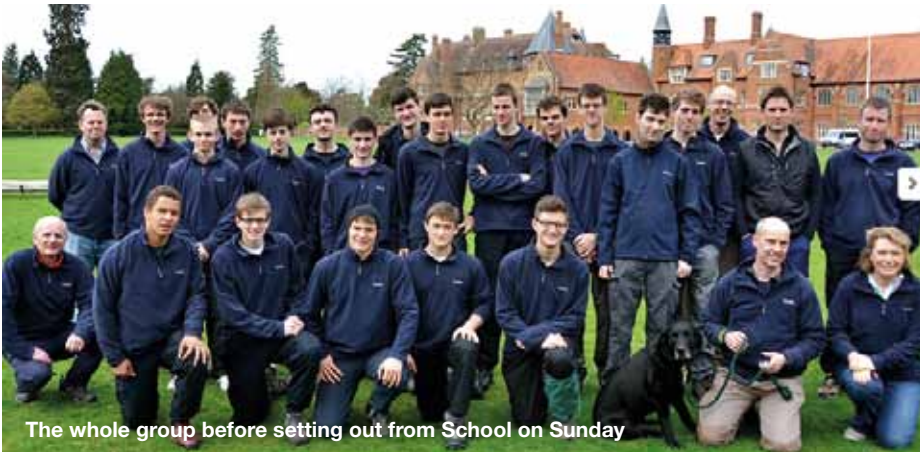
The whole group before setting out from School on Sunday