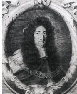
Sir John Holt