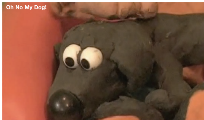
Oh No My Dog!