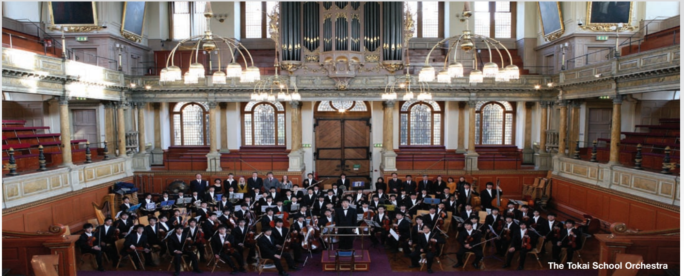
The Tokai School Orchestra

The Sheldonian Theatre, Oxford, provided the magnificent setting for a historic Anglo-Japanese concert on 23 March, performed by the orchestras of Abingdon and Tokai School, Nagoya, Japan. The concert was part of the Japan-UK150 celebrations marking the 150th anniversary of the signing of the Treaty of Yedo, which opened up diplomatic and trade relations between the two countries.