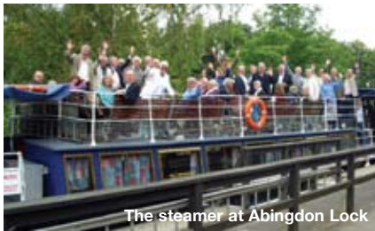
The steamer at Abingdon Lock

On 25 September 2008, sixty-five Old Abingdonians and their partners took a return trip from Oxford to Abingdon on one of Salters' traditional river steamers, with lunch enjoyed to the sounds of a New Orleans' style jazz band.