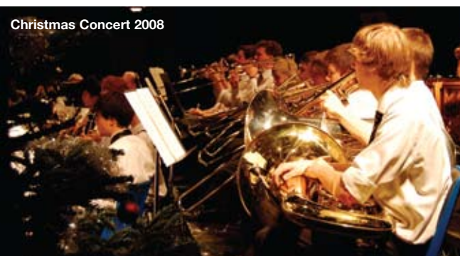
Christmas Concert 2008