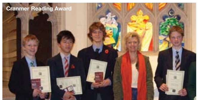
Cranmer Reading Award