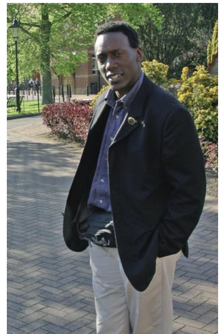
The former Zimbabwean cricketer, Henry Olonga, at the School on 5 May.