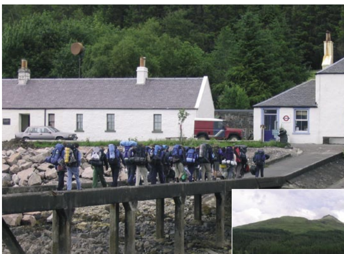
Arrival and departure from Inverie

The Duke of Edinburgh Gold Qualifying Expedition to Knoydart in the Western Highlands gave twenty-three boys an experience of living in an extremely remote area. The only village on the peninsula is Inverie and the only way to get there and back is by ferry from Mallaig – unless you want to walk the sixteen mile route over rough country.