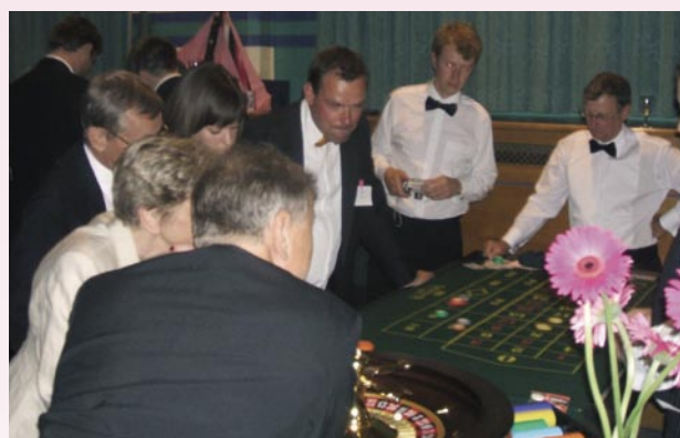
Casino in the Charles Maude Room at the President's Dinner