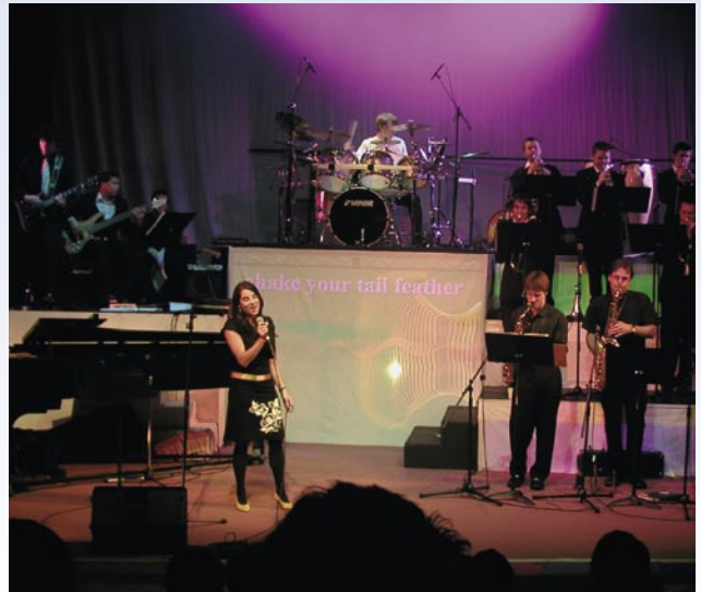
Fantastic jazz in the Amey Theatre