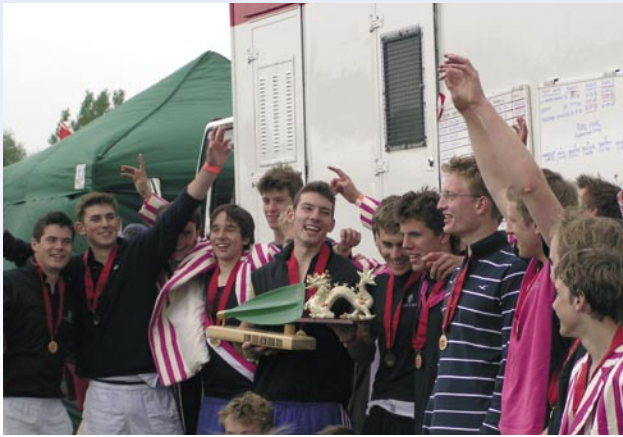
The Dragon Boat victors

The challenge is to raise £30,000 so that the Abingdon Film Unit can go to Cambodia to make a film about landmine victims for the charity Landmine Victim Support . Last term's Make a Difference Day saw a variety of fund-raising activities from sponge-a-teacher to a quick cricket contest. Shake Your Tail Feathers , an evening of fantastic jazz in the Amey Theatre, raised £1,100 for the cause. More money came from Abingdon's rowers who competed in – and won – the annual Dragon Boat Race on the Thames at Abingdon. Whilst on 4 July, just four days after losing to Portugal, a slightly revamped English team beat Germany 2 – 0 in a closely fought match on Waste Court Field.