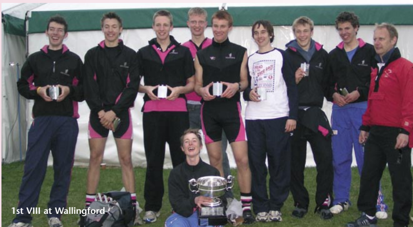
1st VIII at Wallingford

In the Princess Elizabeth Cup at Henley Royal Regatta this year the 1st VIII beat Monmouth and The Oratory but lost by a third of a length to Philips Academy, Andover, USA. This followed a season in which they won the Junior eights at Reading, Wallingford and Bedford where they also won the Senior One eights.