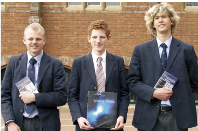
Three physics medallists.