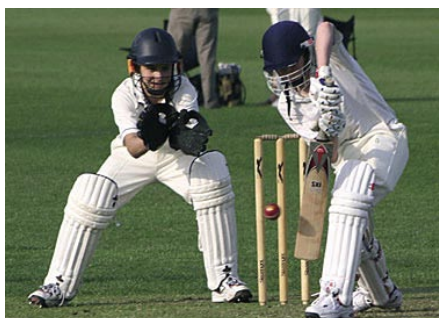
The Under 14s

The 1st XI had a successful end to their season when they beat Radley for the first time in fifteen years, the score, Abingdon 169 all out to Radley's 160. Meanwhile the Under 14s won the final of the Oxfordshire section of the Lord's Taverners' Cricket Competition for the second year running, beating Magdalen College School by 83 runs.