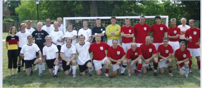
The English and German teams