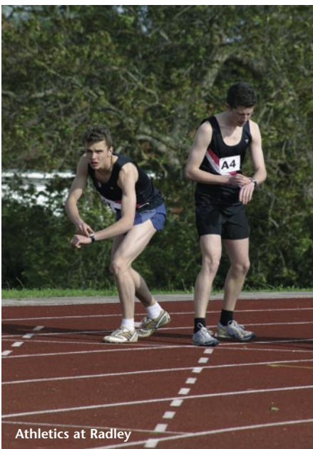
Athletics at Radley

The Boarders were the overall winners of the House Competition, winning both the 3rd and 4th-year levels, Elliott's won the 5th-year level and Franklyn's the 6th.