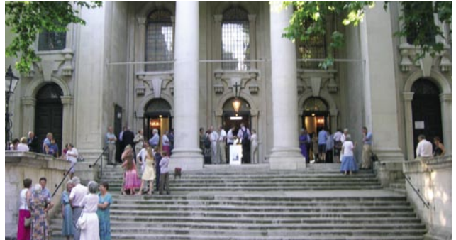
The audience appreciating the evening sunshine during the interval at this well attended concert on 3 July.