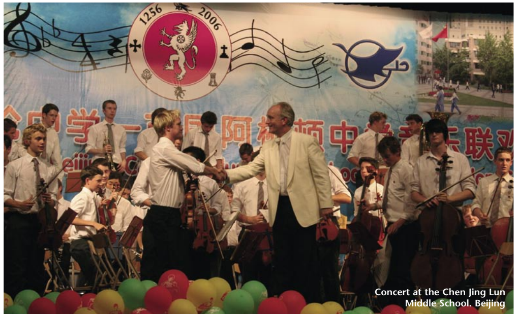
Concert at the Chen Jing Lun Middle School, Beijing

Awards continued to come in over the summer holiday when the School's musicians achieved a double success in the National Chamber Competition.