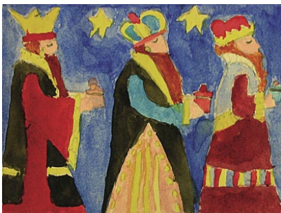
Charles Studdy's Three Kings