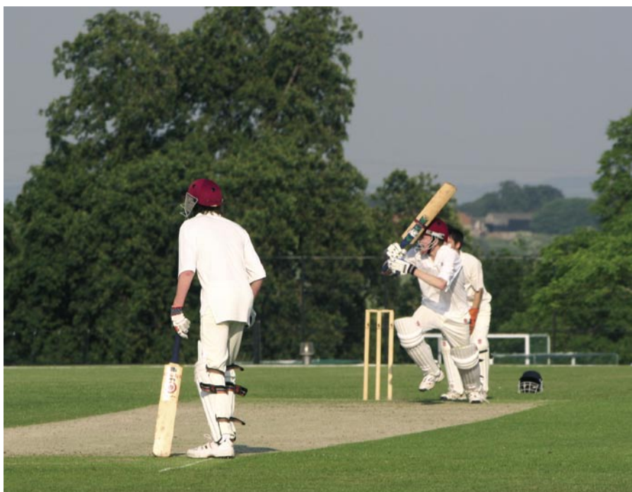
The 1st XI against Radley